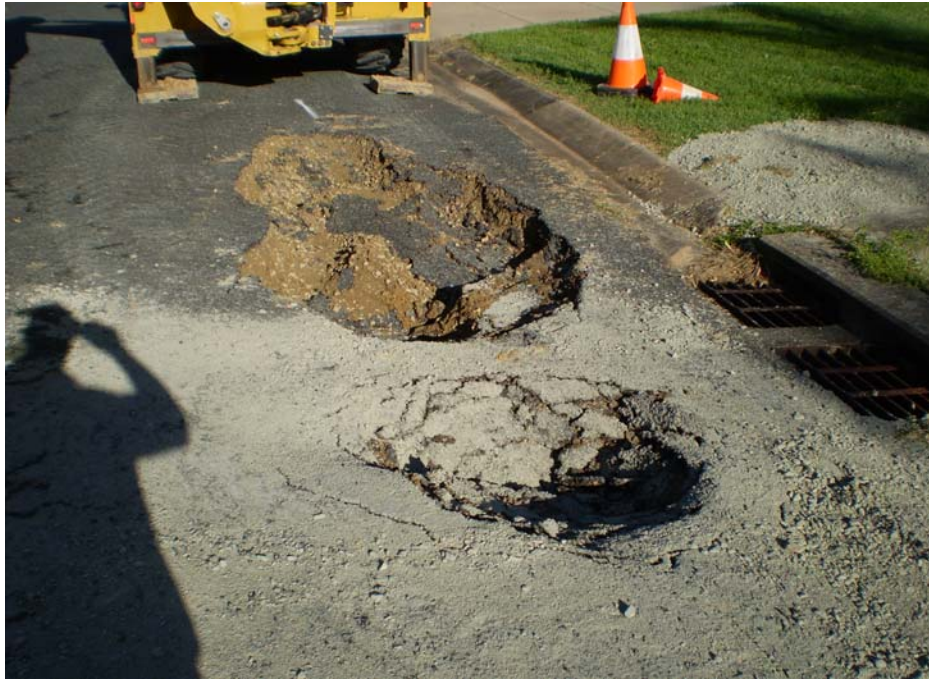
Amhurst Street – Slade Point