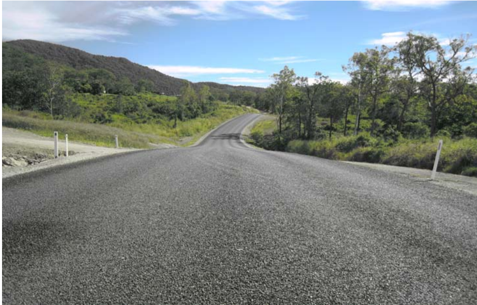
Middle Creek Road