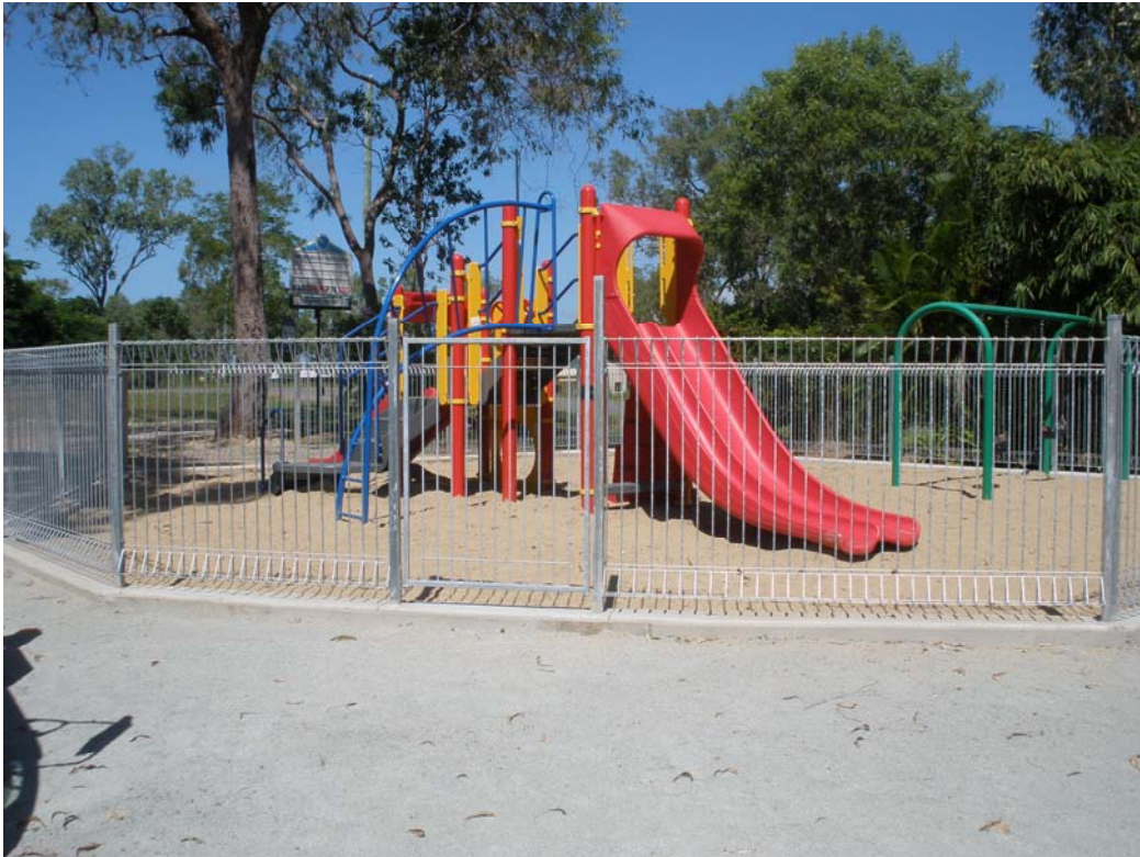
Armstrong Beach Community Hall Playground