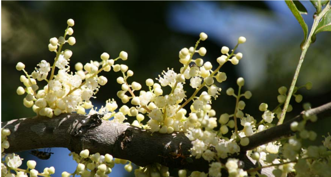
Lepiderema sp. (Impulse Creek A.B.Pollock 73)

the Central Queensland Coast bioregion at Impulse Creek, located at the headwaters of Conway National Park.