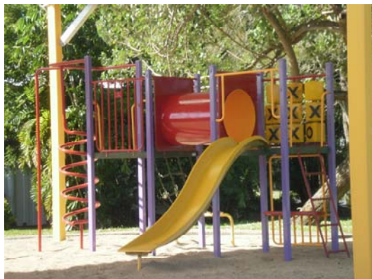
Griffin St Park Repaint Play Equipment

Other repairs completed included the fitting of metal gates to the Victor Creek amenities, the fitting of doors and jambs at Quota Park. Five vandalised Indicator bolts were replaced at seven locations. The removal, repair and replacement of four park bench seats was undertaken at various locations. Three monthly RCD checks were conducted on switchboards throughout the regions parks.