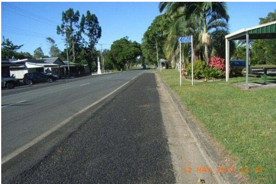
Anzac Parade, Finch Hatton - (2009 Flood Saturation Damage Restoration Package 902)