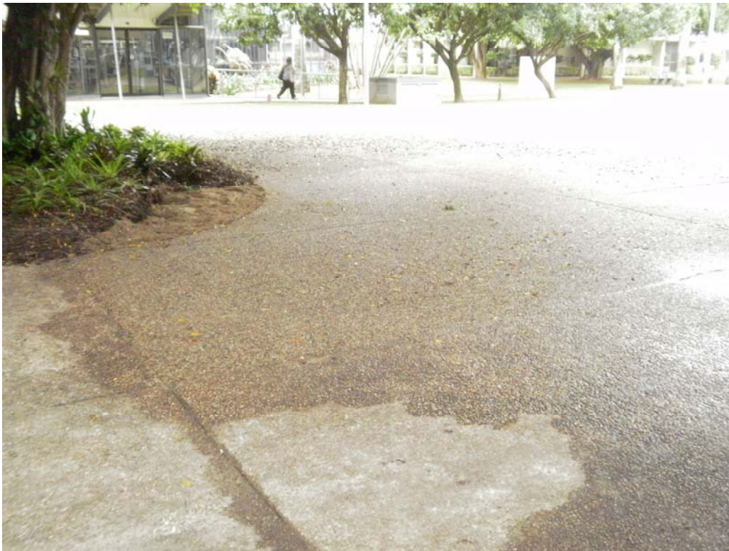
Removal and Replacement of Exposed Aggregate Concrete to remove trip hazards, Civic Centre Precinct.