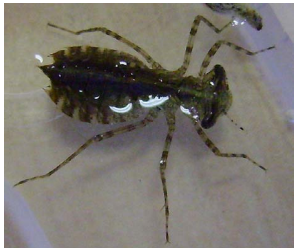
Dragonfly nymph on display

Due to the wet weather, Schools have been limited in their visitation due to lack of covered areas for large groups, so the ‘Plant-ed Elsewhere’ (Outreach) Program has been visiting schools instead. On cancellation of their visit on April 6 th , 4 prep classes from Mackay North Primary School had resources from the Gardens displayed in the school’s hall for very large interactive sessions covering habitats, lifecycles, leaf shapes and mini-beasts. 2 classes of St Francis Year 3s were visited on April 13 th with mini-beasts from both land (above and below) and water ecosystems to demonstrate the biodiversity of creatures that Humans impact on when altering environments. The same day 3 Beaconsfield Prep classes were also visited with similar interests as Mackay North...Mini-beasts, habitats, and life cycles. To all schools live creatures, pinned specimens and real examples of plants and habitats (example nests, etc) are presented and these are with supported with posters, stimulus photos, books and conversations / talks.