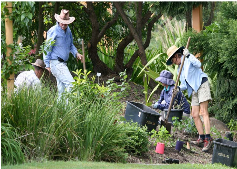
Gardens Friends Planting Bee – Heritage Gardens

A Garden Friends Planting Bee was held on Saturday April 16 th with almost 200 plants being planted in the Heritage Garden, Whitsunday Garden and adjacent Demonstration Garden by 15 volunteers.