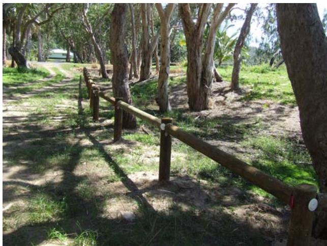
Fencing on Ball Bay Foreshore, to delineate vegetated buffer strip and define beach access points