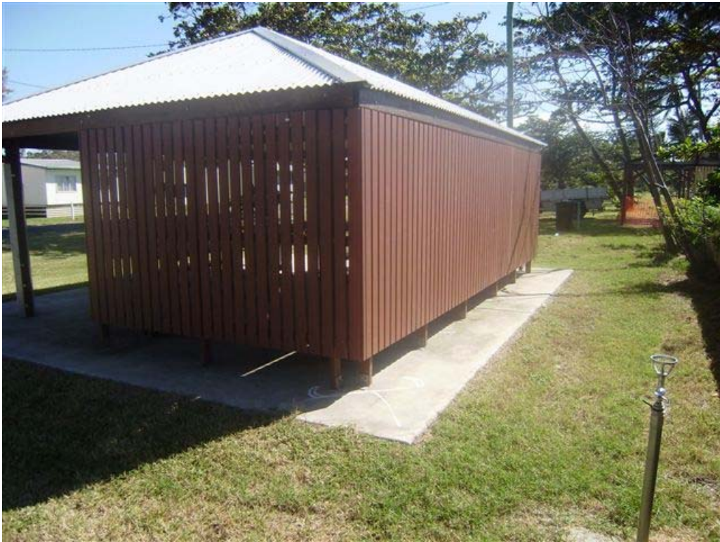
Weather Screen to Midge Point Picnic Shelter