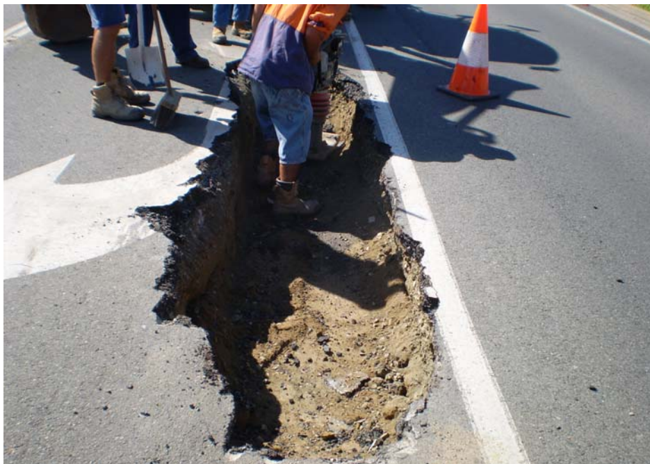
Maple Drive Andergrove - Working on Intersection of Maple Drive and Oak Street