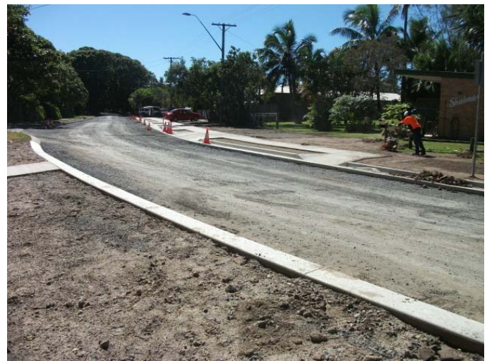
Mango Avenue Reconstruction, Eimeo