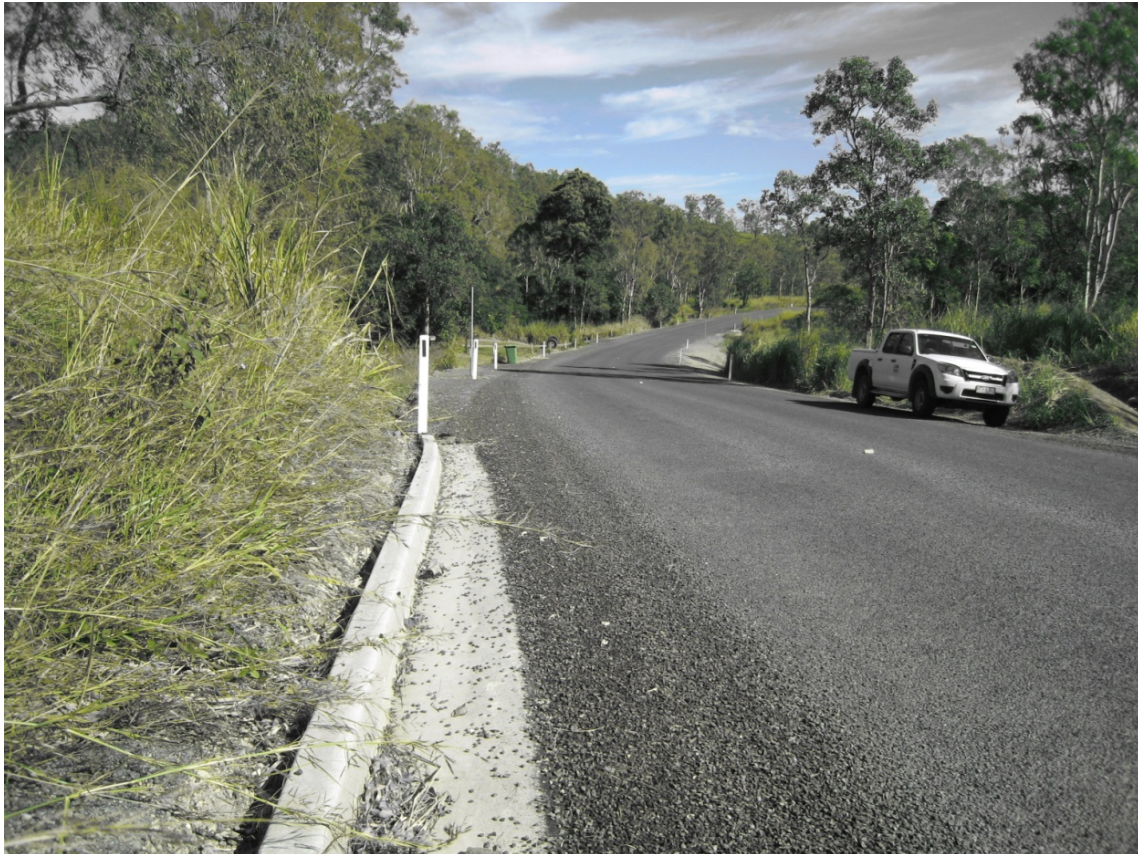
Kinchant Dam Road