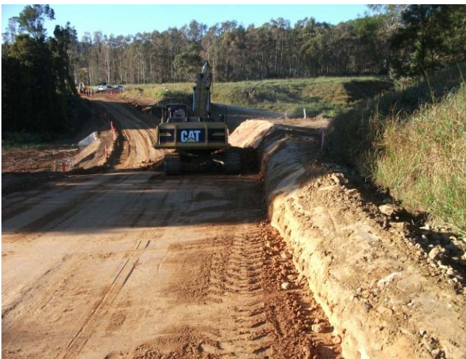
Crediton Loop Road, Crediton