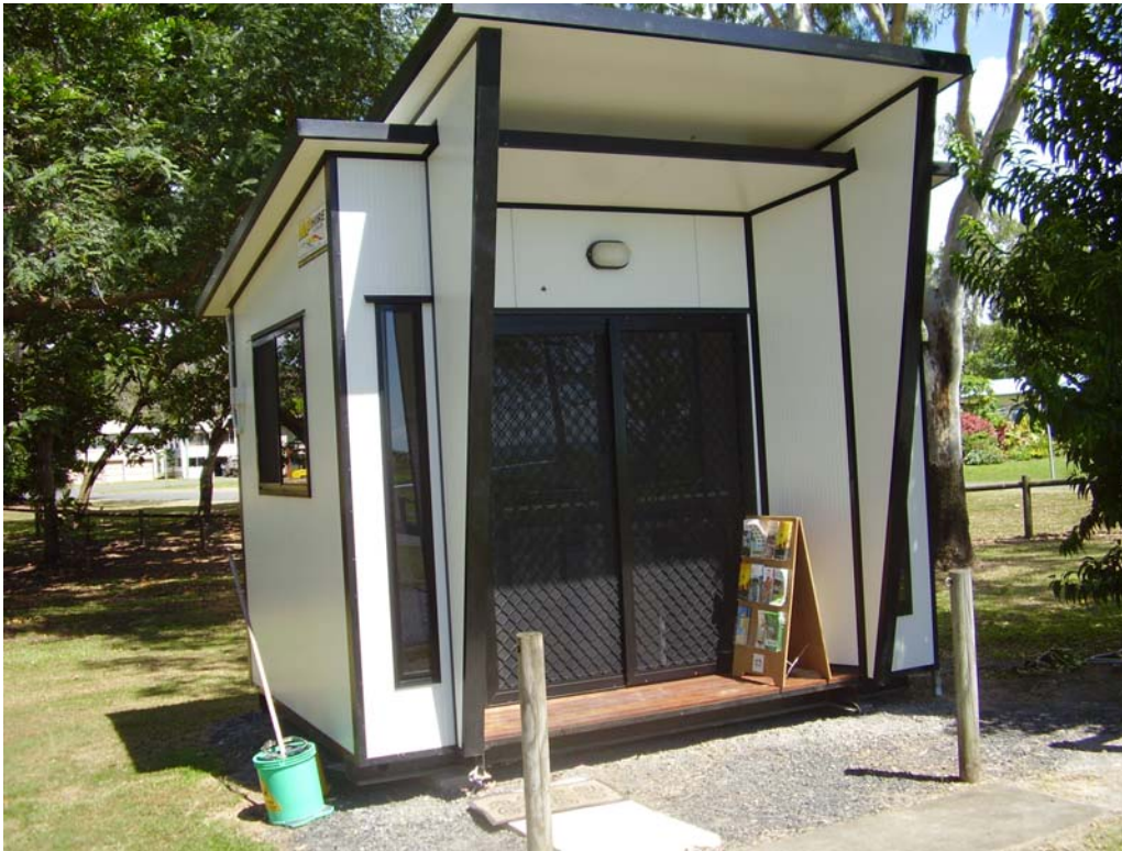
Booking Office Seaforth Campground 1