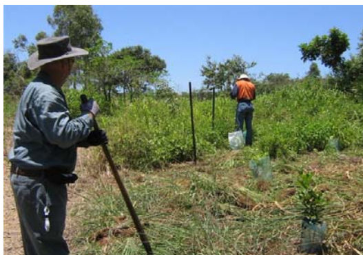
Conservation Volunteers undertaking weed control work at Louisa Creek

Sarina beach crew staff assisted with the clean up after the severe storm which occurred at Campwin Beach in late January. Mackay Beach crew inspected and maintained the swimming enclosures at Seaforth, Bucasia and McEwens Beach.