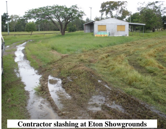
Contractor slashing at Eton Showgrounds

Sothern Region Activities – January – 340000m2 mowed, 120 hours spent whipper snipping.