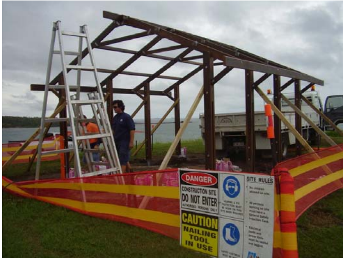
Coral Point Picnic Shelter