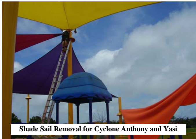
Shade Sail Removal for Cyclone Anthony and Yasi

A seat was also installed at Midge Point and a memorial seat at Blacks Beach.