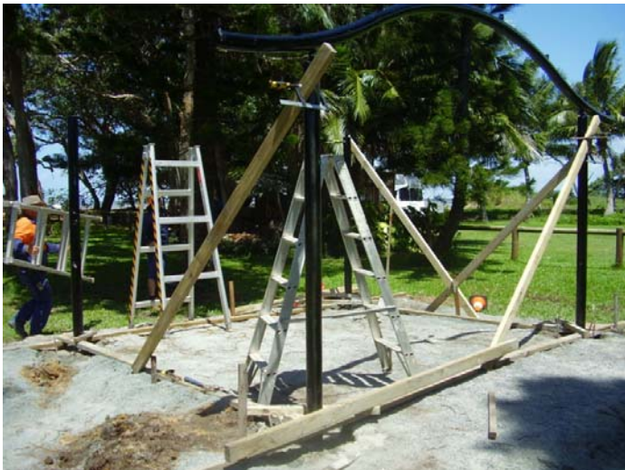
Melba Park Shelter