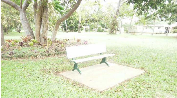
Seat Midge Point