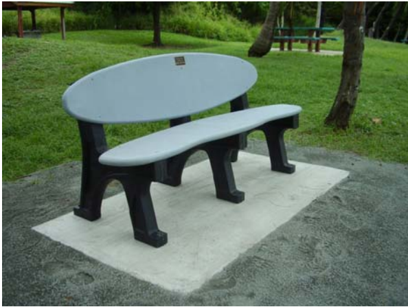
Memorial Seat Blacks Beach