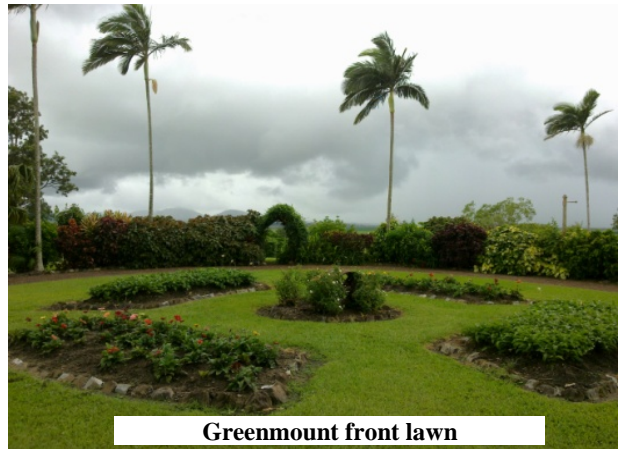
Greenmount front lawn

Natural Environment and Marine Beach Activities - Conservation Volunteers Australia worked for a week at Louisa Creek, undertaking weed control and revegetation maintenance, in conjunction with Sarina Landcare Catchment Management Association, funded by BMA. They also worked for 4 days at Finlayson's Pt (Seaforth) and Ball Bay, working to implement elements of the beach plans, including weed control and maintenance of revegetation. These days were at no cost to council, to make up for volunteer number shortfalls for previously funded weeks.