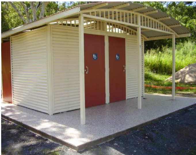
Mt Bassett Amenities