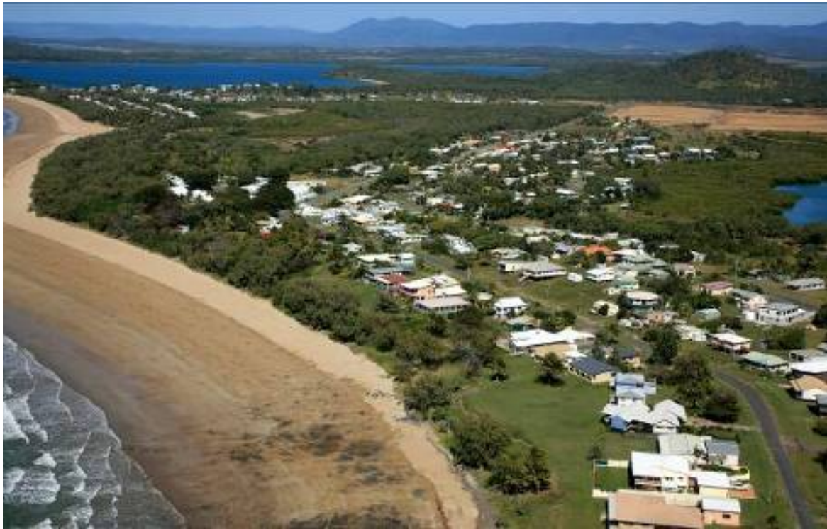
Figure 1a – Aerial Photo Zone A Campwin Beach Esplanade and dunes