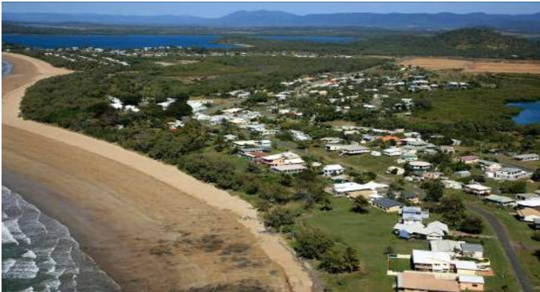
Protection and Rehabilitation of Sarina Beaches Coastline