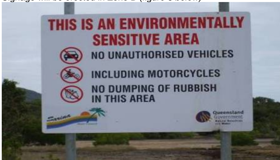
Figure 3 Environmentally Sensitive Area Sign

Signage will be erected in Zone B ( figure 3 below )