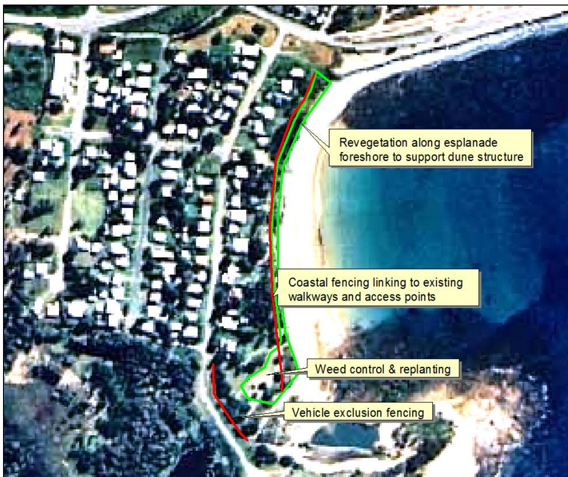
Figure 1 Half Tide Beach Esplanade

Sarina Coastal Sustainable Landscapes Project – Half Tide Beach Supported by BHP Billiton Mitsubishi Alliance (BMA)