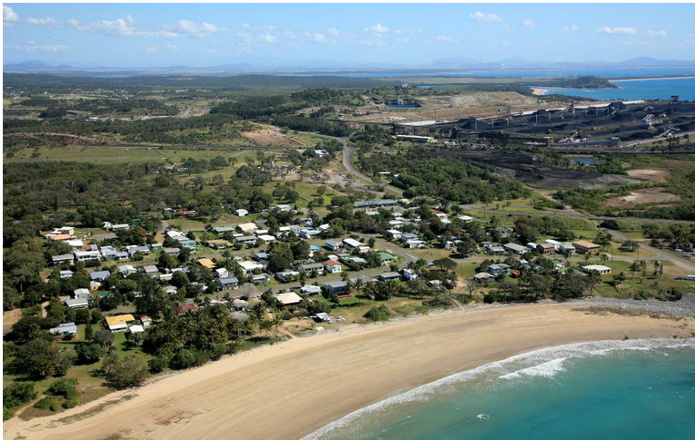
Protecting and Rehabilitating Sarina Beaches Coastline