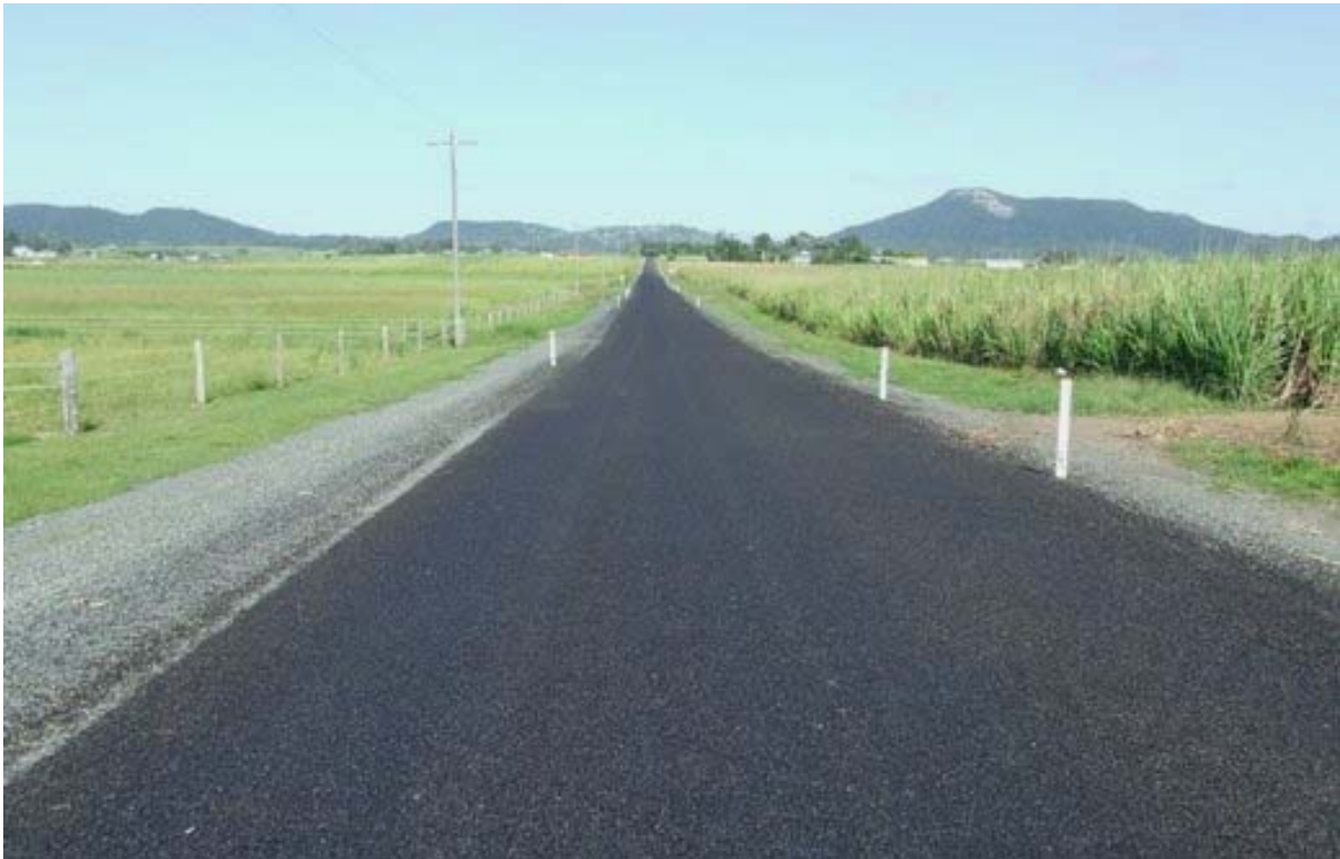
Trevaskis Road, Farleigh - Flood Package 11 Midge Point 2008