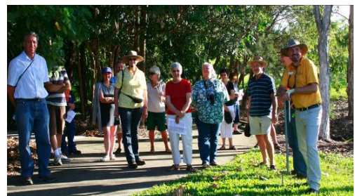
Gardens Friends guide walk

A group which regularly meets at the Gardens is the Botanic Art Interest group and during October, their efforts in representing the flora of the Gardens was displayed in their 4 th annual exhibition showcased in the Lagoons Gallery.