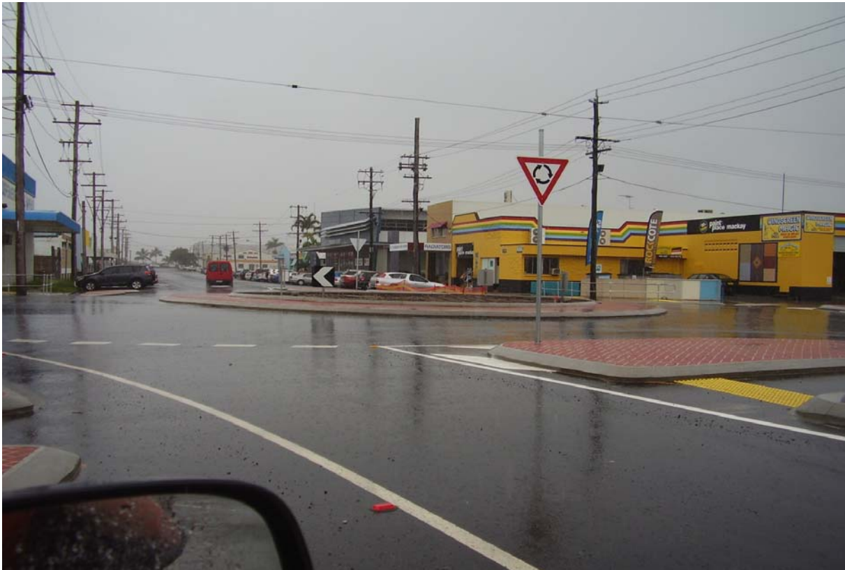
Gordon Tennyson / Street roundabout