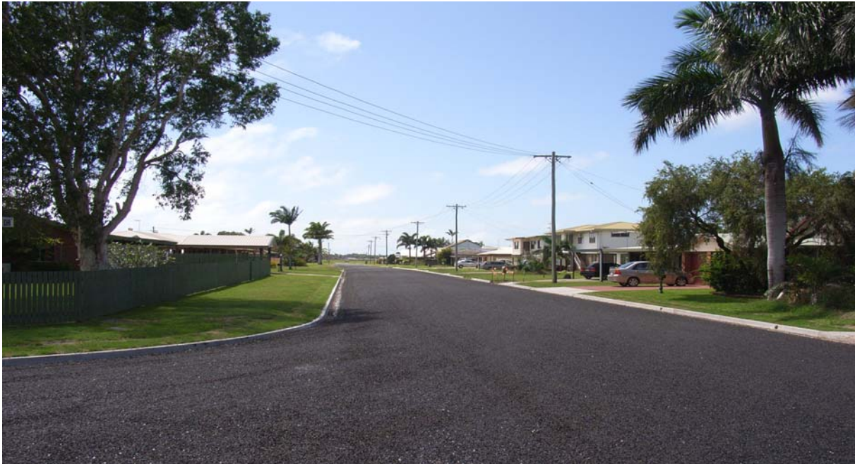
Flood Package 10 – Mackay South, 2 2008