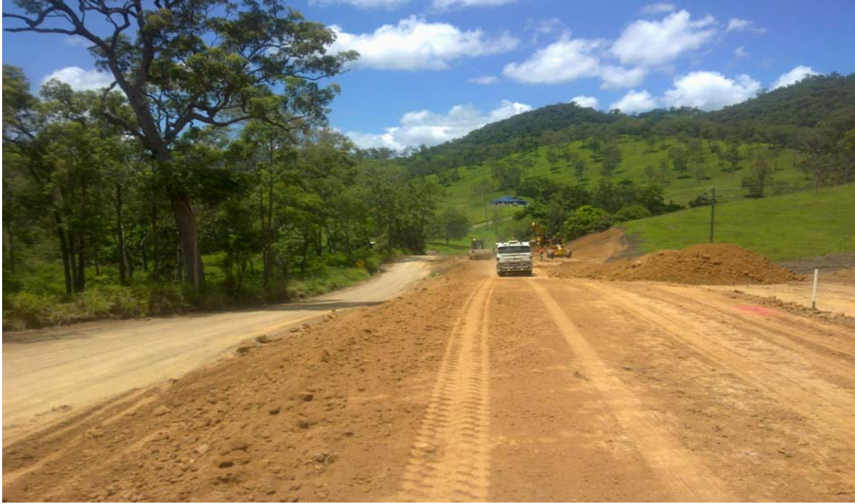
Middle Creek Dam Road