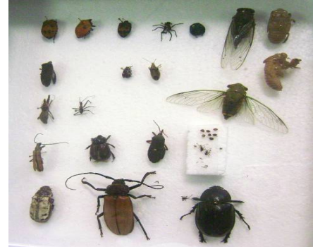
Insect identification for schools

A Friends Planting bee on October 9 saw another 200 plants added to the Living Collection. Planting occurred in the Australian Regional Flora Terraces – Monsoon and Torres Strait Wetlands, Monsoon Forest and Monsoon Waterfall beds whilst rare and threatened species were added to the South-east Queensland Microphyll Vine Forest bed. This was the final planting bee of 2010 and allowing for delays caused by the Cyclone Ului clean-up, a further 650 plants were added/replanted during the year by volunteers.