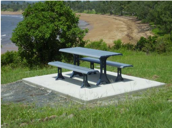
New Picnic setting - Hillside Drive Grasstree Beach