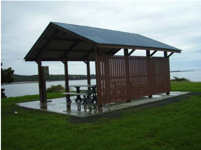
Screen Wall to shelter at Coral Point Campwin Beach