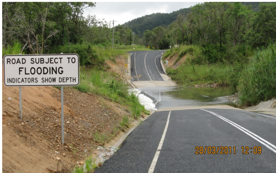
Rifle Range Road Reconstruction – Plane Creek Crossing