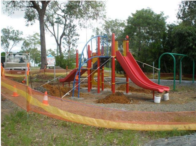
Armstrong Beach Community Hall new playground and fence