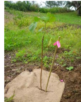
Tree planting at Ball Bay