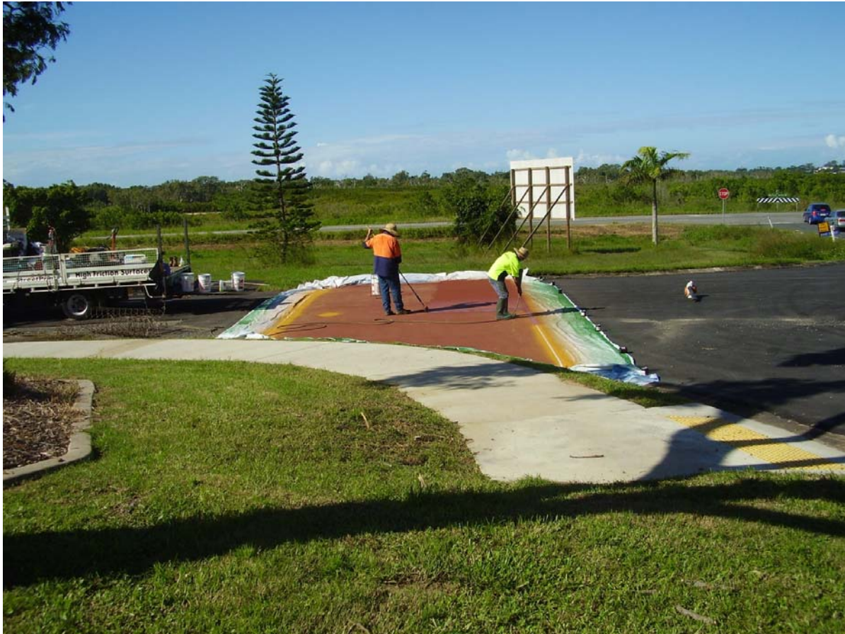
Jenvey Court - Bucasia