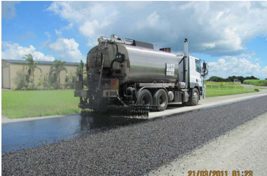
2009 Flood Saturation Damage Restoration Package 906 – Doyles Road

The following projects have been awarded: